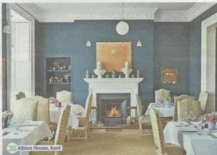
26 Albion House, Kent