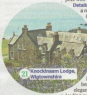
21 Knockinaam Lodge, Wigtownshire

23 The Scarlet Mawgan Porth, Cornwall The Scarlet Hotel is a magical adults-only escape on Cornwall's north coast with light and airy seaview bedrooms